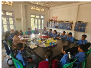
1a. First school Council meeting of 2026