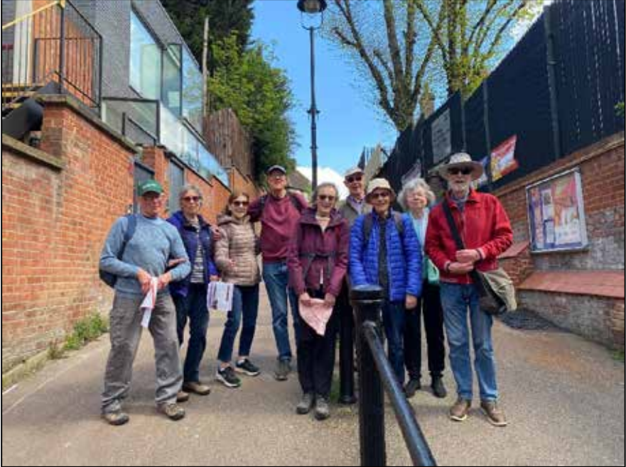
Trinity Walk, Swiss Cottage

but there was a pedestrian crossing! Just before our next stop we ascended 'Trinity Walk' which is described by the route planners as being, 'possibly the steepest part of any Unlock walk ever!